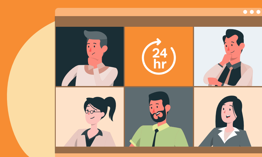
Have 24 hour non-stop video meetings