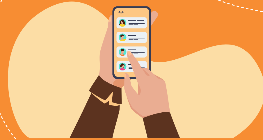
Use Merged Contact List to meet professional and personal collaboration needs