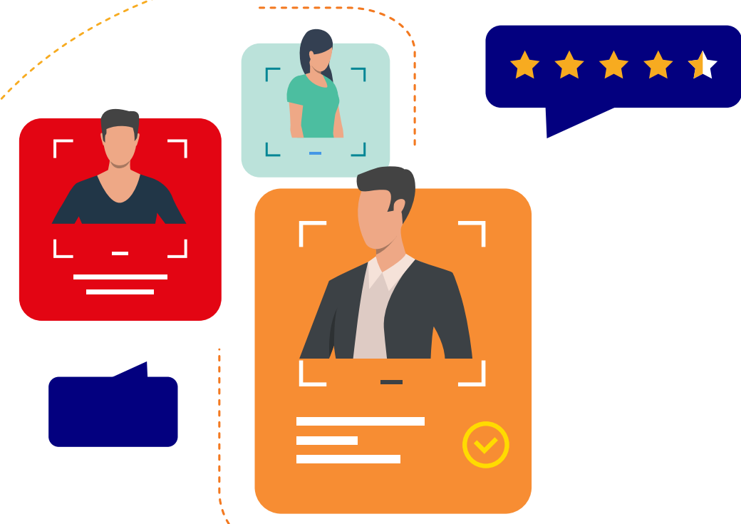
Employees for team meetings, reviews and discussions