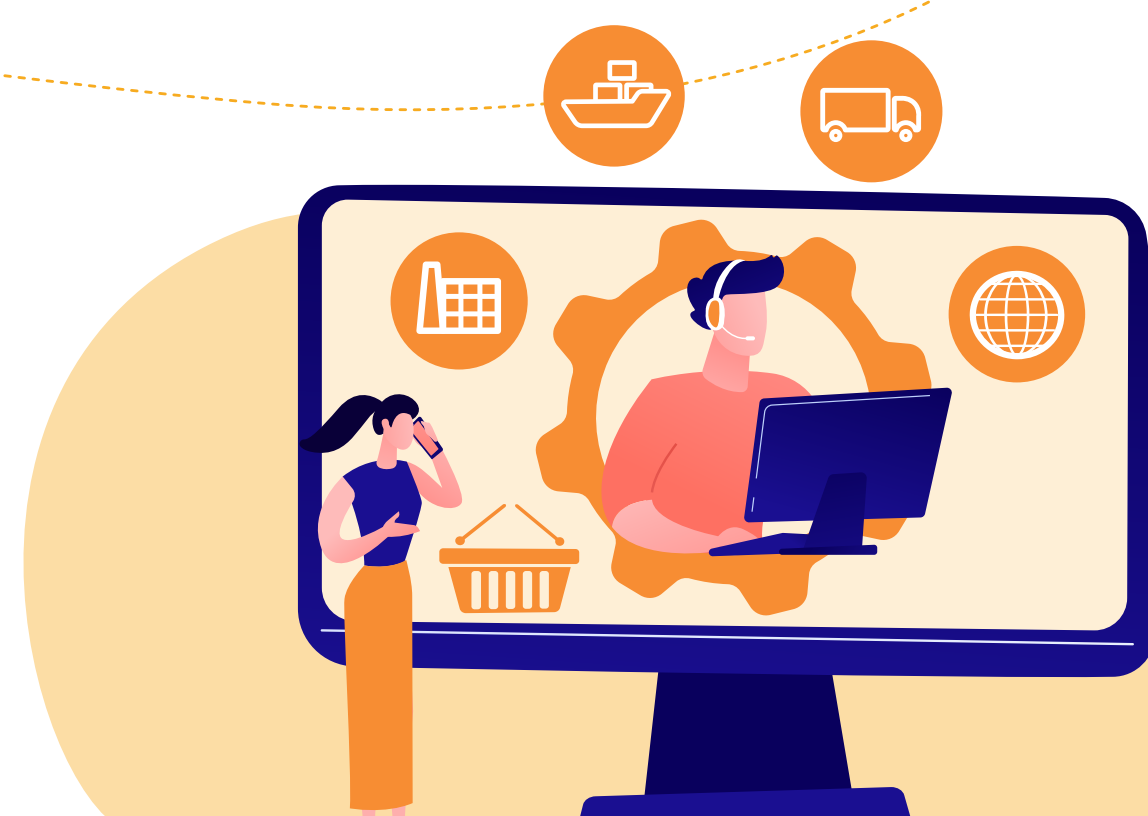
Suppliers and vendors for placing inventory order

Get JioMeet , India's own, secure video conferencing solution for everyday business and give your business the edge it deserves.