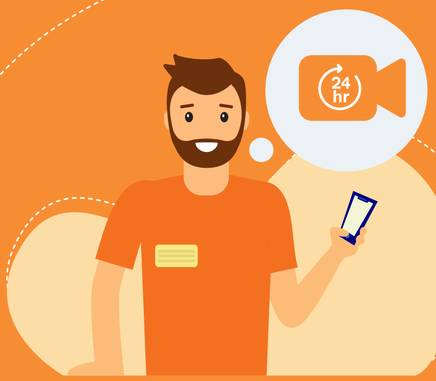
So, he decided to use JioMeet, India's own 24 hr video-conferencing app for product demos