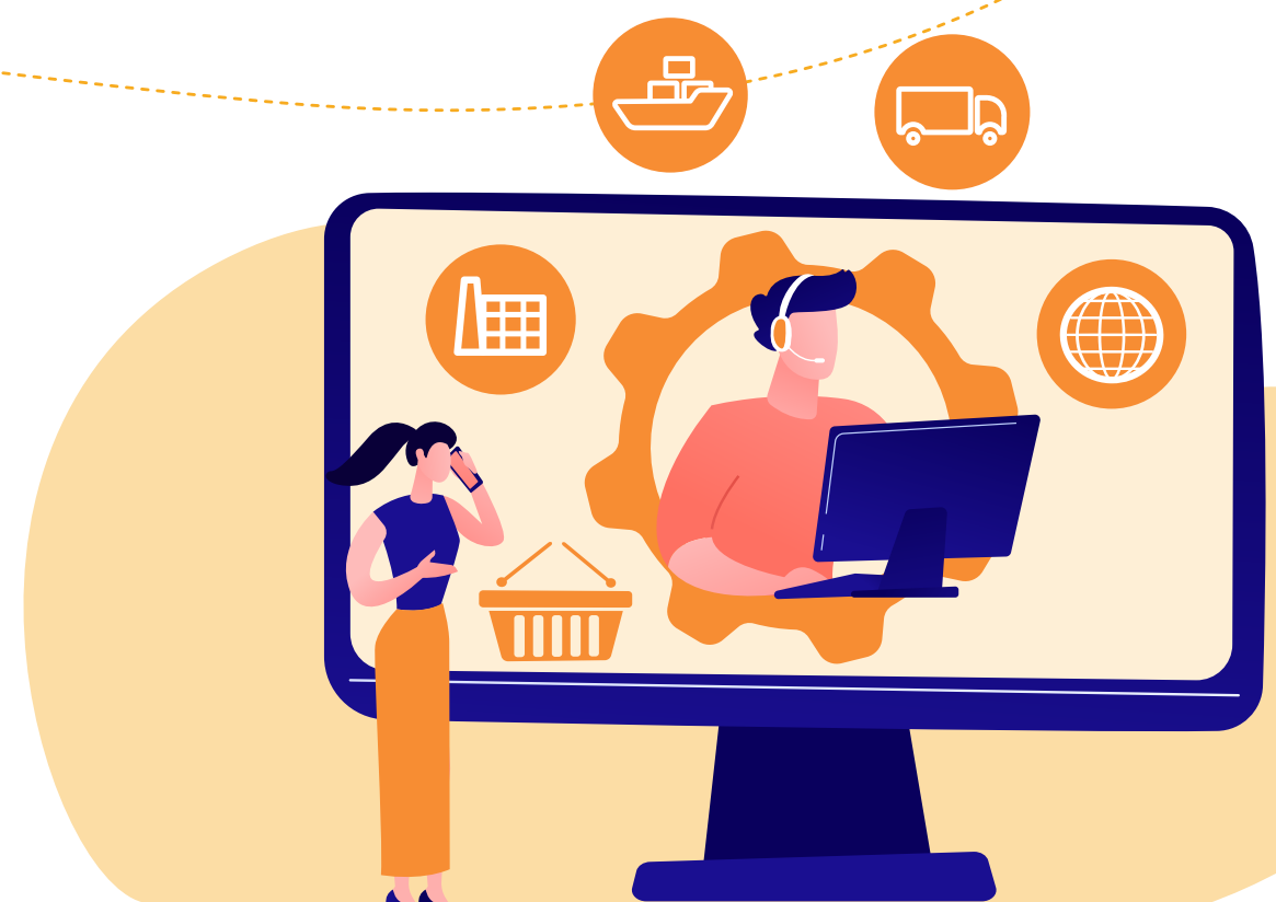
Suppliers and vendors for placing inventory order

Get JioMeet , India's own, secure video conferencing solution for everyday business and give your business the edge it deserves.