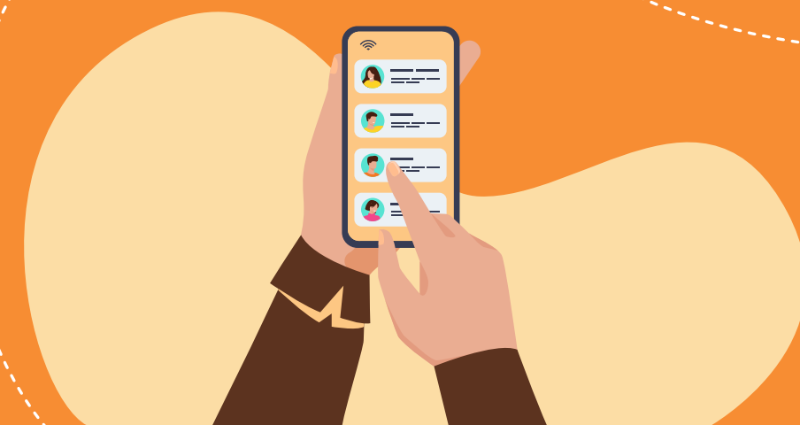
Use Merged Contact List to meet professional and personal collaboration needs