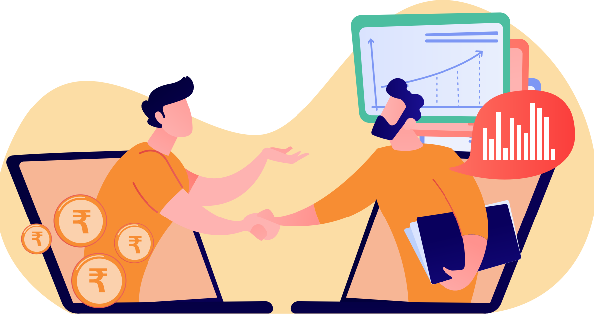
Prospect customers to pitch products/ services

Like Arun, you too can do so much with JioMeet . For instance, connect with your