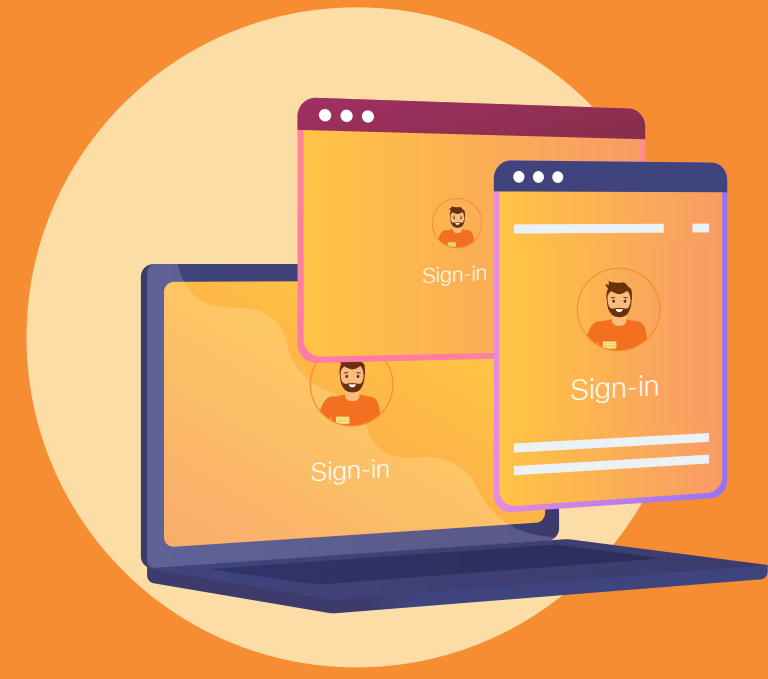
Sign-in simultaneously on multiple devices, switch between multiple devices during a call

Like Arun, you too can do so much with JioMeet . For instance, connect with your