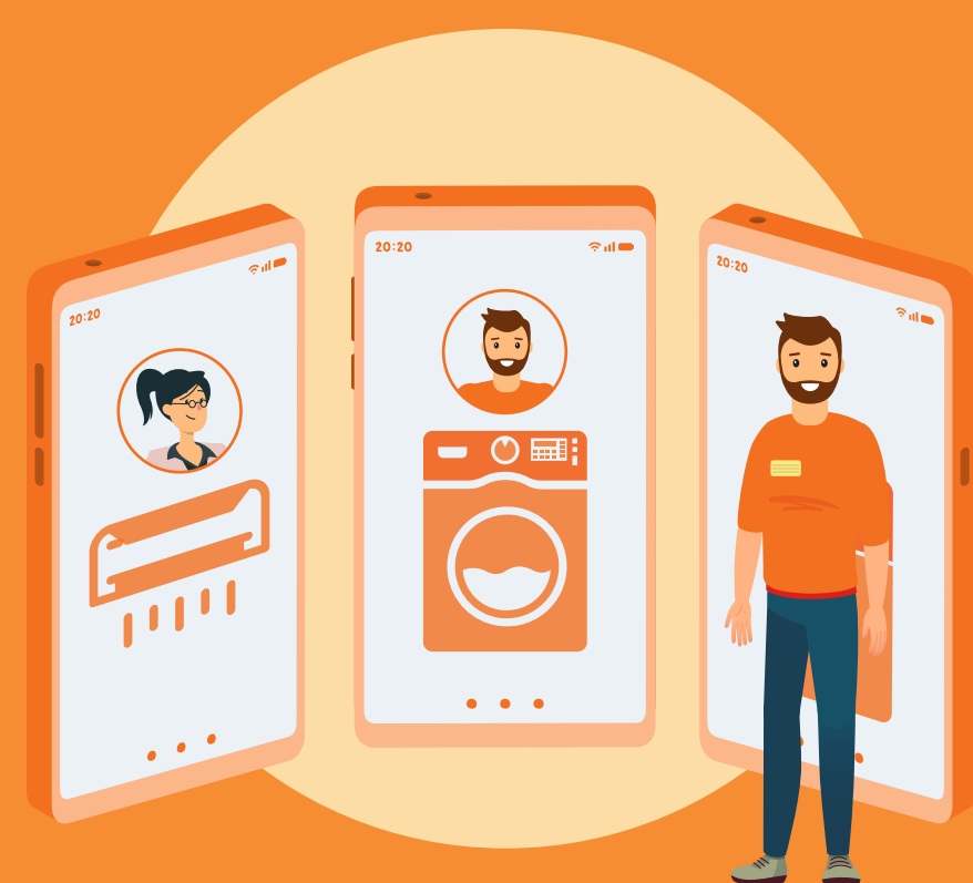
With HD video calls Arun had engaging interactions with customers which helped him close deals much faster