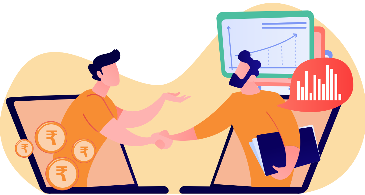
Prospect customers to pitch products/ services

Like Arun, you too can do so much with JioMeet . For instance, connect with your