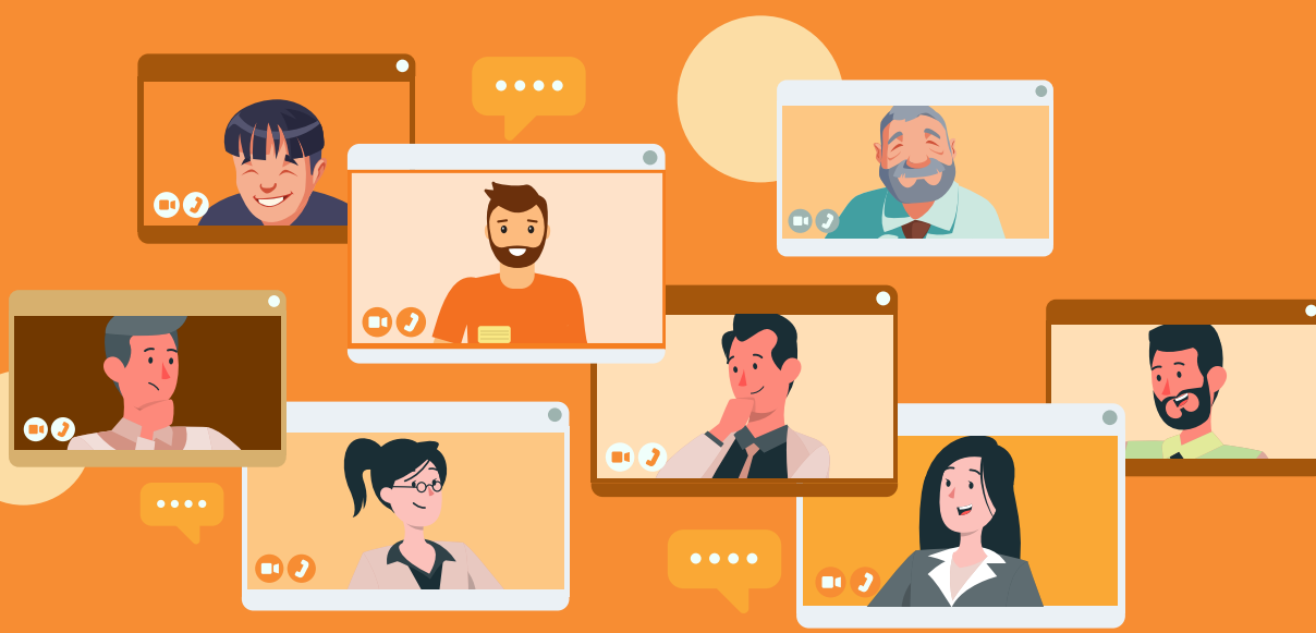
Conduct meetings with customers, partners and people from other organizations with up-to 250 participants