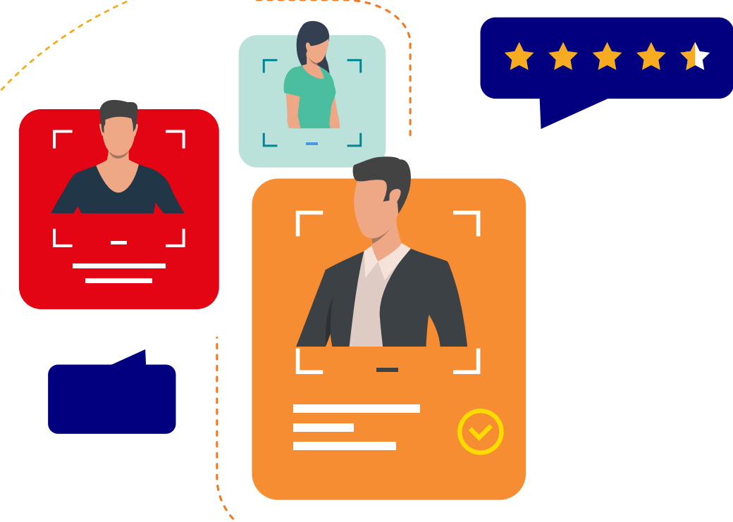
Employees for team meetings, reviews and discussions