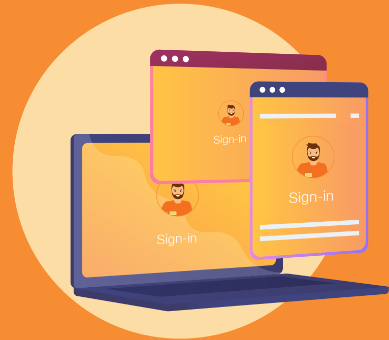
Sign-in simultaneously on multiple devices, switch between multiple devices during a call

Like Arun, you too can do so much with JioMeet . For instance, connect with your