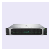
HP DL 360 Gen 10 RACK Servers