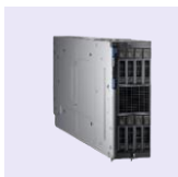
Dell PowerEdge R640, R740 RACK Servers

The solution can be deployed on variety of hardware including RAC based or chassis-based servers. Below is the list of preferred HW providers.