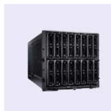
Dell PowerEdge M1000e Enclosures with MX740/840 Servers