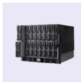
HP ProLiant C7000 Enclosures with BL460 Gen 10 Servers

Copyright © 2021, Reliance and/or its affiliates. All rights reserved. This document is provided for information purposes only, and the contents hereof are subject to change without notice. This document is not warranted to be error-free, nor subject to any other warranties or conditions, whether expressed orally or implied in law, including implied warranties and conditions of merchantability or fitness for a particular purpose. We specifically disclaim any liability with respect to this document, and no contractual obligations are formed either directly or indirectly by this document. This document may not be reproduced or transmitted in any form or by any means, electronic or mechanical, for any purpose, without our prior written permission. Jio is registered trademarks of Reliance and/or its affiliates. Other names may be trademarks of their respective owners.